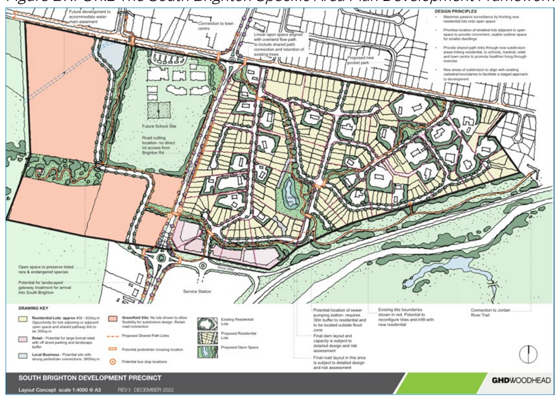
Figure BRI-S11.2 The South Brighton Specific Area Plan Development Framework