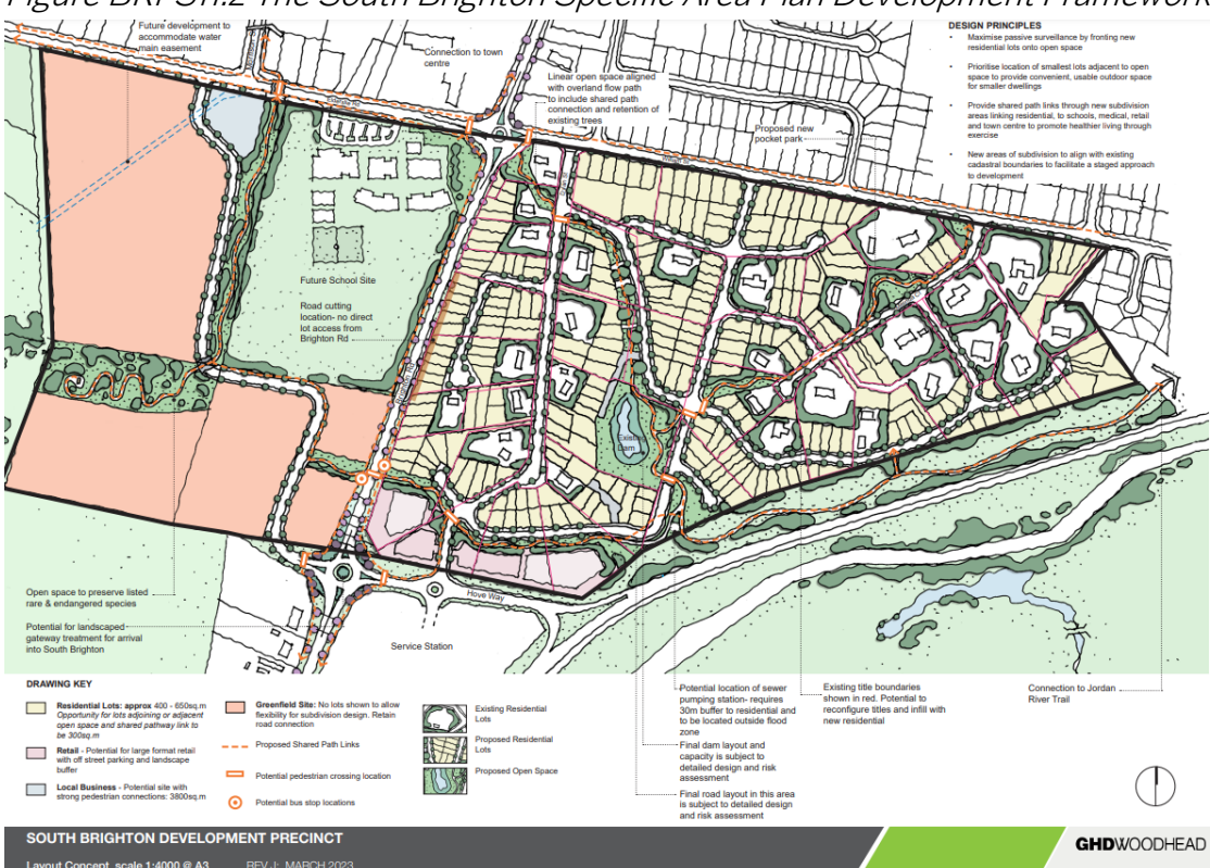
Figure BRI-S11.2 The South Brighton Specific Area Plan Development Framework

b. Amend the wording of subclause BRI-S11.8.2 P1.2 by removing 'Council's adopted Key Infrastructure Investments and Defined Infrastructure Charges policy that is relevant to the land.' and replacing with 'Council's adopted Infrastructure Contributions Policy that is relevant to the land'.