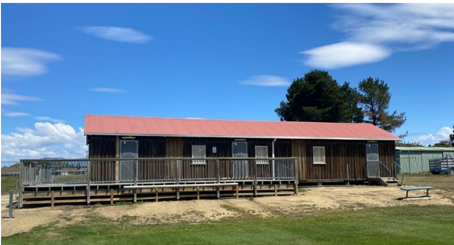
Figure 1: Existing building at Ted Jeffries Memorial Park

The report also prepares Council for the tender / removal of the existing building at Ted Jeffries Memorial Park shown below in Figure 1.