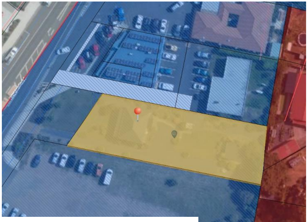
Figure 1: Subject site (highlighted in yellow)

Pursuant to the LPS, the entirety of the site is currently zoned General Business (see Figure 1).